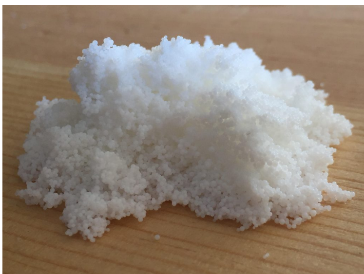
A weakly acidic ion-exchange resin used for pH control

Plants in recirculating systems will change the pH of their solutions through nutrient uptake. This means that the pH of a recirculating hydroponic system will be inherently unstable and will require constant corrections. We usually carry out these corrections through the use of strong acids or bases, such as the commonly used pH up/down solutions we buy at stores. This makes the process of pH adjusting repetitive. Although many people have implemented automated systems for pH correction, these systems have potential for failure, especially due to sensor calibration or failure issues. Ideally, we would want a completely passive solution to maintain the pH of our hydroponic nutrient reservoir.