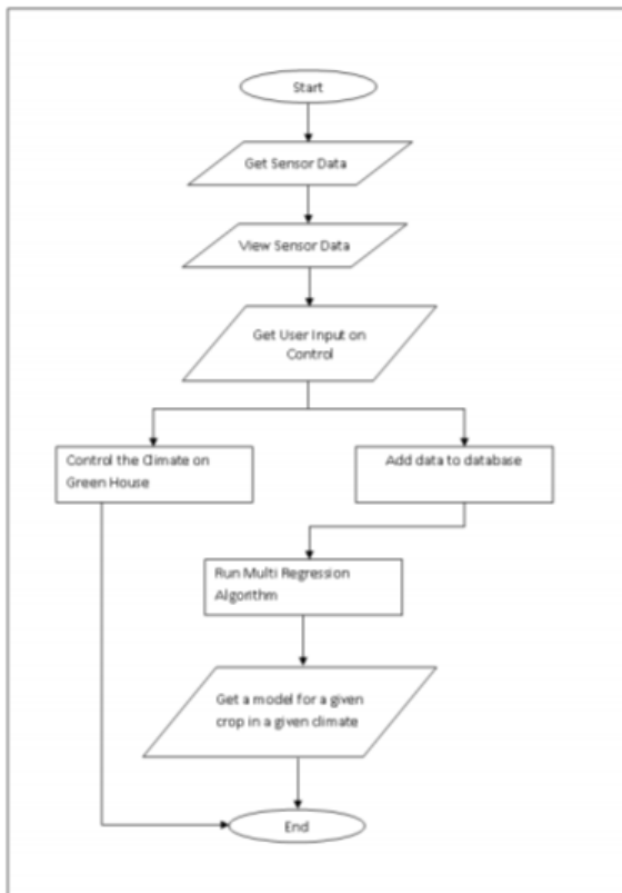
Fig. 11. Overall process of the System