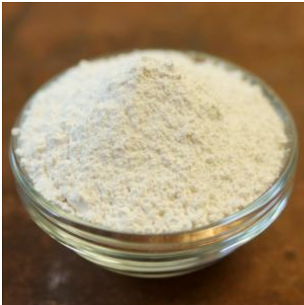
Calcium sulfate dihydrate (gypsum)

Calcium is a very important element in plant nutrition and can be supplied to plants through a wide variety of different salts. However, only a handful of these resources are significantly water soluble, usually narrowing the choice of calcium to either calcium nitrate, calcium chloride or more elaborate sources, such as calcium EDTA. Today I am going to talk about a less commonly used resource in hydroponics – calcium sulfate – which can fill a very important gap in calcium supplementation in hydroponic crops, particularly when Ca nutrition wants to be addressed as independently as possible and the addition of substances that interact heavily with plants wants to be avoided.