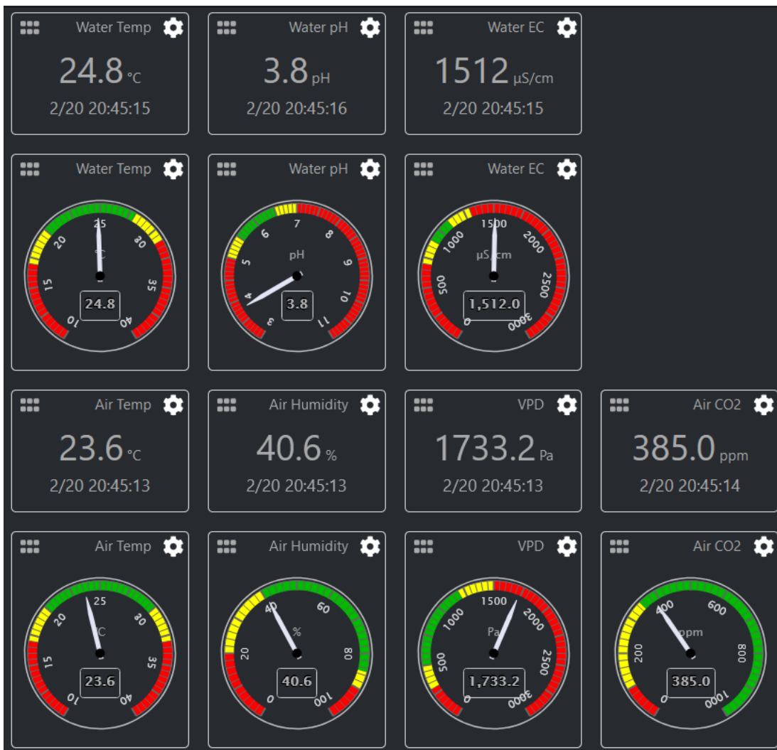
Another sample MyCodo panel

system where a device in a network can listen to or publish to different “topics”. So you can have an Arduino that publishes messages under the topic “HumiditySensor1” that contain the humidity value measured at each point in time and you can have it at the same time subscribe to a topic called “HumidityControl” and when it receives an “on” message in this topic it turns on a dehumidifier. You can then use MyCodo to “listen” to the humidity sensor messages, execute its own control algorithms on it, and publish the adequate control action to the “HumidityControl” topic whenever it thinks that a dehumidifier needs to be turned on. This is the way in which my custom-built Arduino/Raspberry PI control implementation generally works.