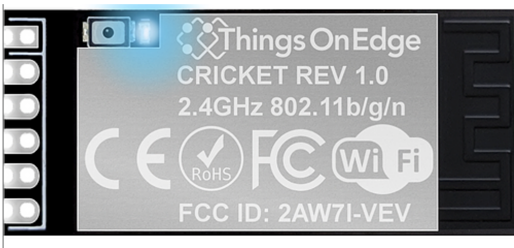
The cricket IoT board by ThingsOnEdge

When you monitor variables in a hydroponic plant where more than a few plants exist, it becomes important to be able to deploy a wide array of sensors quickly and to be able to set them up without having to lay down a couple of miles of wire in your growing rooms or greenhouses. For this reason, I have been looking for practical solutions that could easily connect to Wi-Fi, be low powered, allow for analogue sensor inputs and be more user friendly than things like ESP8266 boards that are often hard to configure and sometimes require extensive modifications to achieve low power consumption. My quest has ended with the finding of the “cricket” an off-the-shelf Wi-Fi enabled chip that fulfills all these requirements (you can find the sensor here ). Through this post, I will talk about why I believe it’s such a great solution to deploy sensors in a hydroponic environment. It is also worth mentioning that this post is not sponsored.